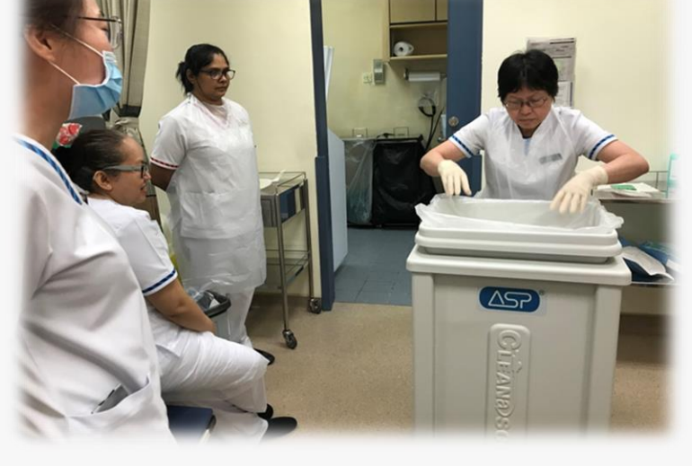
Staff training conducted to ensure nurses' competency